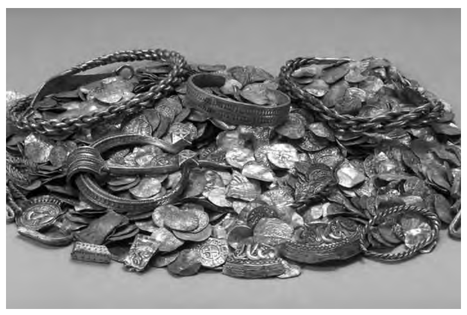
Silver coins and other silver objects from the late Iron Age.

Up to at least the end of the 13th century, five different types of penny were minted inside what are Sweden's borders today and each type was tallied in its own way. There were Geatish pennies, Svealand pennies, Gotlandic pennies, Scanian pennies and pennies from the county of Jämtland. The last two types of penny were part of Danish and Norwegian minting, respectively, while the first two types – Geatish and Svealand pennies – were united into a single mainland monetary system, Swedish pennies, sometime around the year 1300. Gotlandic pennies have been found in many places round the Baltic Sea and played an important role in the south-eastern part of mainland Sweden up to at least the 1260s, 9 but also later in the 15th century.