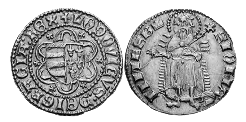
Hungarian florin struck in 1353–7.

English gold coins were in frequent use in Sweden during the 15th century. The large coins, nobles, minted during the reign of Edward III, were particularly popular.