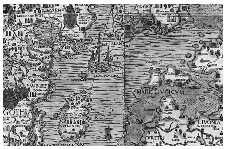
Parts of the Baltic Sea according to Carta Marina, created by Olaus Magnus (1490–1557). The coins of Gotland ('Gotlandia'), lower left, were also used in Götaland ('Gotlia'). Riga (capital of present-day Latvia) in Livonia, lower right, minted coins according to the standard of Gotland in the 13th century. In Åbo in Finland (to the right of 'Alandia'), coins of Riga and 'Rivalia' (present-day Tallinn in Estonia), visible to the right, were circulating in the 15th century. The currency of the Swedish realm was sometimes denominated as 'mark stockholmsk' or 'mark holmsk'. 'Holmia', upper left, is present-day Stockholm.

Lübeck. <sup>119</sup> The mark silver of Riga was, therefore, at par with 36 schilling or 2½ marks of Lübeck, implying that 1 artig of Riga or revalsk was at par with 6 Swedish pennies (penningar) in the second half of the 14th century.