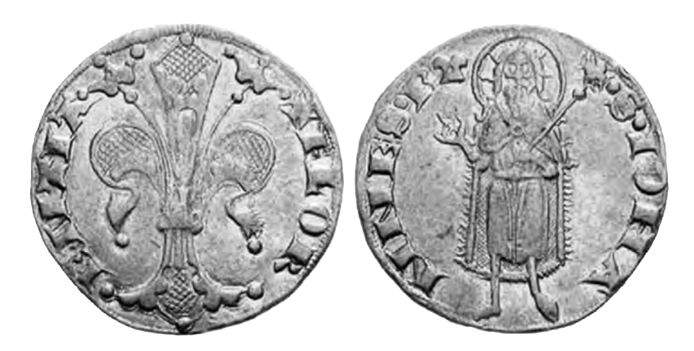
A florin from 1347.

Foreign gold coins were readily accepted in Sweden. The florin (Latin: floreni), the Florentine gold coin with a weight of 3.53 grams, began to be minted in 1252 and quickly became the dominant international trading coin. It is mentioned in Swedish sources from the end of the 13th century and appears frequently during the 14th century, especially in connection with the activities of papal emissaries.<sup>72</sup> During the 15th century, use of the Florentine florin seems to have declined in Sweden; it was partly replaced by the Hungarian florin, which held the same weight and fineness as its Italian counterpart.<sup>73</sup>