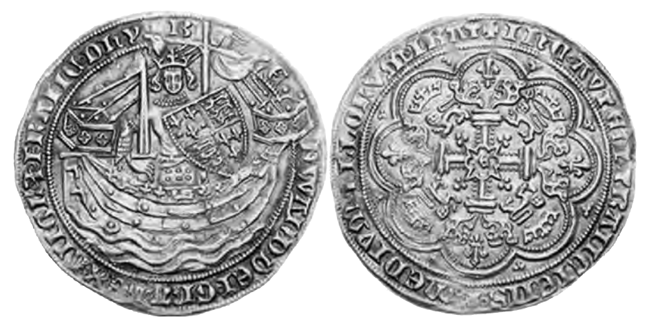
A noble, minted in London in 1354–5. The obverse (left) depicts the king standing in a ship.

English gold coins were in frequent use in Sweden during the 15th century. The large coins, nobles, minted during the reign of Edward III, were particularly popular.