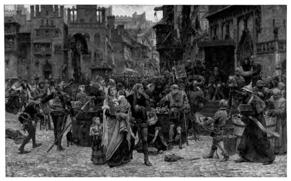
Valdemar Atterdag Holding Visby to Ransom, 1361, signed in 1882 by Carl Gustaf Hellqvist (1851–90), a Swedish history painter. The Danish king Valdemar IV (Valdemar Atterdag) is depicted collecting taxes from the inhabitants of Visby on the island of Gotland in 1361. The townspeople were required to fill three large barrels with gold, silver and other valuables. Gotland had previously been part of the Swedish kingdom; the island suffered an economic decline in the late Middle Ages, probably due to long-term structural factors rather than to the Danish invasion. Some details in the painting are incorrect. For example, the man on the right appears to be Jewish, but there were no Jews at that time in Visby. The dachshund is another anachronism since the first dachshunds were bred in the 16th century.

synonyms. ^{108} If there was a difference between the mark of 32 gotar and the mark stackota of 24 gotar, where the latter was worth ^{3} 4 of the former, it is clear that mark gutnisk was used as a term for both.