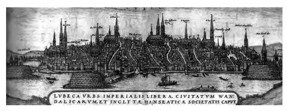
Lübeck in the late middle ages. In the second half of the 14th century the Nordic countries and the Wendish towns formed a monetary system with fixed exchange rates between various coins.

eign coins in this region at the time. The 'hwyte pænnia' (white penny) referred to the German (and to a lesser extent the Danish) Witten coin, with the nominal value of 4 penning or 1/48 of a Lübeck (or Danish) mark. The 'ænglisk' (engelsk) mostly referred to the Danish 3-penny coin, equal to 1/64 of a Danish mark or one English sterling. Thus the relation states that one mark örtug was equal in value to 32 gotar or gutniska, or to half a Lübeck or a Danish mark.