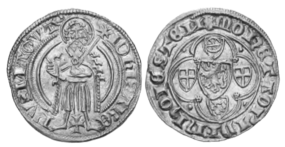
A Rhinish gulden from Mainz, minted between 1399 and 1402.

most widely used type in Sweden was the Rhinish gulden (Latin: floreni rinenses; Swedish: rhensk gyllen). As these coins became widespread during the late 15th and early 16th centuries, it became more common to specify the exchange rate between mark penningar and the Rhinish gulden, rather than the rate of the domestic coin to the silver mark.<sup>74</sup>