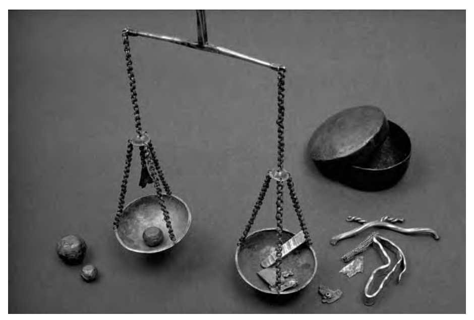
A scale from the late Iron Age. Various medieval monetary units – such as mark, öre, örtug and penning – developed from weight measures with the same names.

gross weight, the fineness and whether it was minted or unminted silver. During the Middle Ages there seems to have been a shift in the meaning of this term. Mark lödig came to denote a gross weight rather than (almost) pure silver.<sup>29</sup>