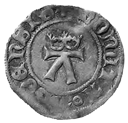
A minted örtug from Åbo in Finland in the second half of the 14th century; it contained around one gram of fine silver. At that time, one örtug was a male unskilled labourer's pay for around four hours' work in Stockholm (its equivalent in the late 1990s would be a 500-kronor note). It could buy around 0.9 kg of butter or four litres of beer.

The circulation of the worst coins would imply a tenfold increase in prices, assuming that prices followed debasement. However, prices are missing for several years. Although direct exchange rates between mark silver and mark penningar are missing for the years when the deterioration in value most likely took place (1352–3 and 1361–2), there are two notations on foreign coins. Using cross exchange rates, these two notations provide information about the value of mark silver in mark penningar. The two quotations show that the exchange rate deteriorated substantially, although not as much as the decrease in the fine silver content of the most debased coins.