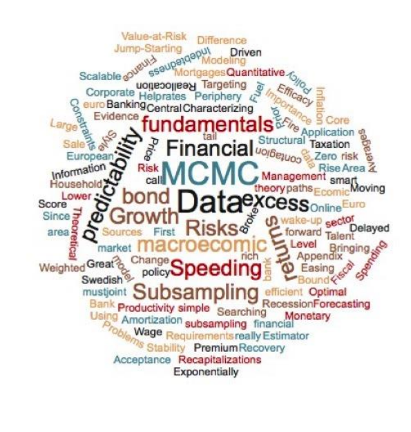
Figure 1: Research Topics Cloud